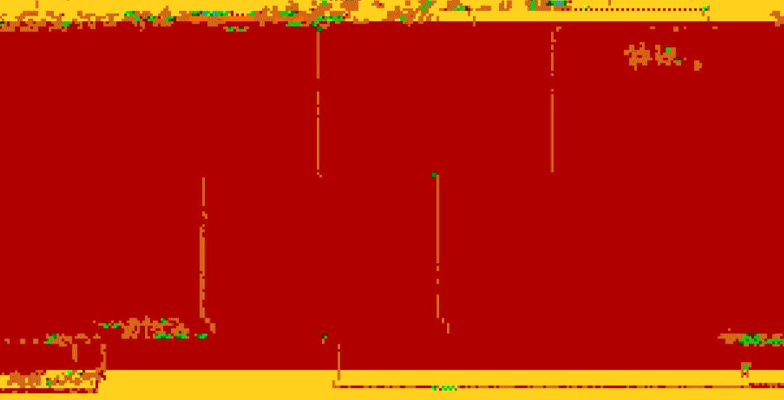
Figure 4. Hand displacement and target displacement over time. The hand displacement (red line) and target displacement (blue line) are plotted against time. The hand displacement starts at 0 cm and increases towards the target displacement. The target displacement starts at 0 cm and increases towards the hand displacement. The hand and target displacements are connected by a spring.

Figure 3. Hand displacement and target displacement over time. The hand displacement (red line) and target displacement (blue line) are plotted against time. The hand displacement starts at 0 cm and increases towards the target displacement. The target displacement starts at 0 cm and increases towards the hand displacement. The hand and target displacements are connected by a spring.